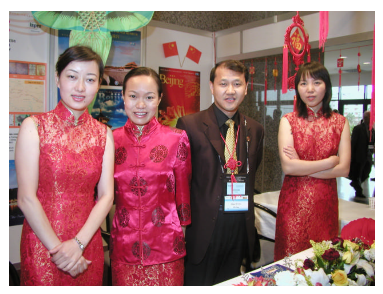
China worked really hard to win the election

The delegate from UK urged Council to ask Technical Commission Presidents to consider joint symposia and meetings. The President replied that this was for Council and the Technical Commission Presidents to consider in the coming week.