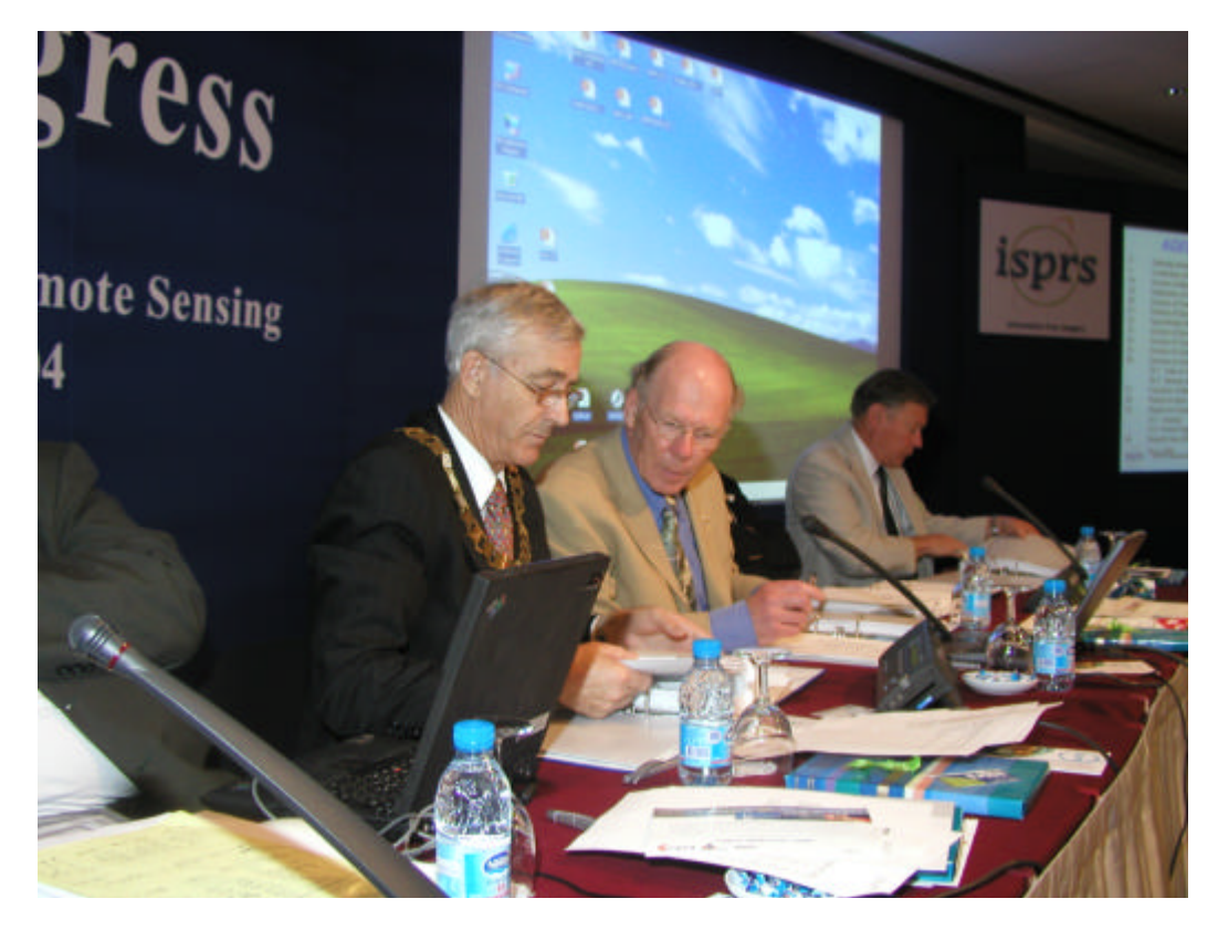
Council presiding at the General Assembly