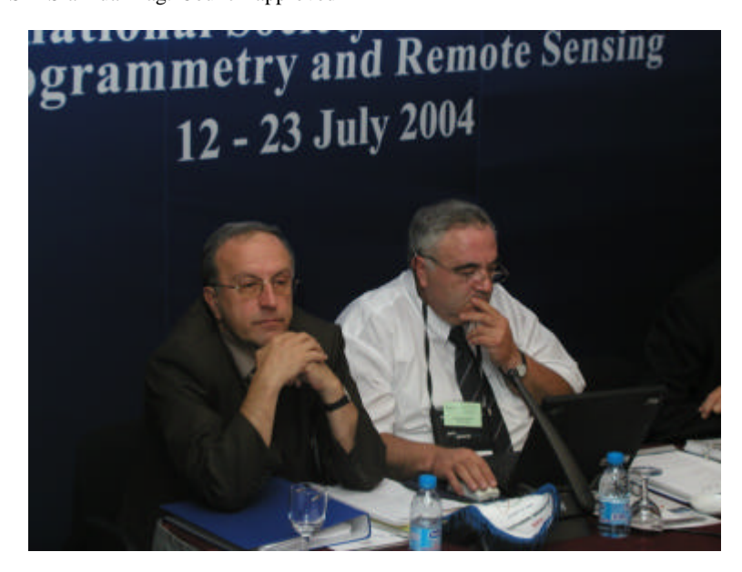
ISPRS Congress Director and Treasurer